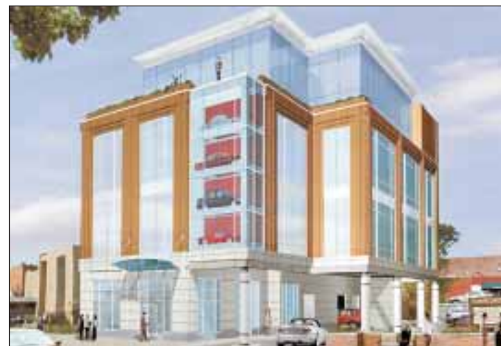
SARATOGA PARKING AND BANQUET INC.

The city has about 4,600 spaces. Please see GARAGE E4 ▶